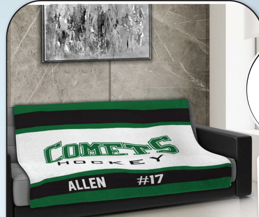
Team Blanket in Plush and cozy Mink Flannel Fleece

Mink Flannel (BETTER) - Ultra plush mink on both sides, very soft with mid perceived thickness