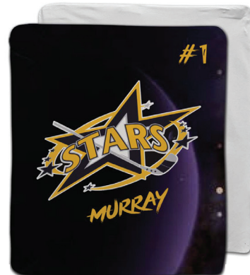
Team Blanket in Ultra Soft and Smooth Microfleece

Microfleece (GOOD) - Ultra smooth feel, fleece on both sides, lower perceived thickness