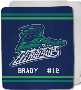
Team Blanket in Plush Sherpa Faux Wool Lined Micro Mink

Sherpa (BEST) - Faux wool rear side with ultra soft mink front, very plush with highest perceived thickness