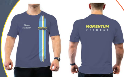
MODEL IS WEARING A LARGE

Starting point of the T-shirt is white and we are dye subbing all over (front and back). Super soft and the most comfortable Fabric. 4way stretch to fit all body shapes and sizes. Seamless around shoulders and armpits to avoid chafing and to produce perfect prints. 95% Polyester / 5% Spandex, moisture wicking fabric. 1" bottom hem.