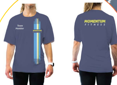
MODEL IS WEARING A SMALL

Available in any PMS color or Full Graphics Background. 1-color or full color logos front and back or all over. All sizes are 1 price.