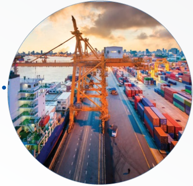
Global Sourcing and Logistics