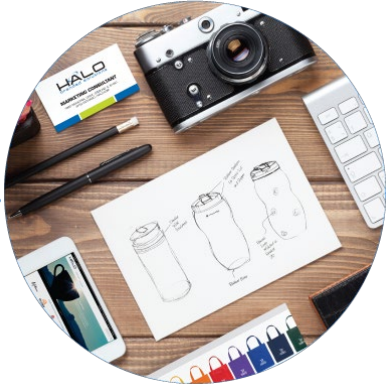
Full Creative Support

We distinguish ourselves in the marketplace with a comprehensive suite of support services to enhance our clients' initiatives and meet their business objectives.