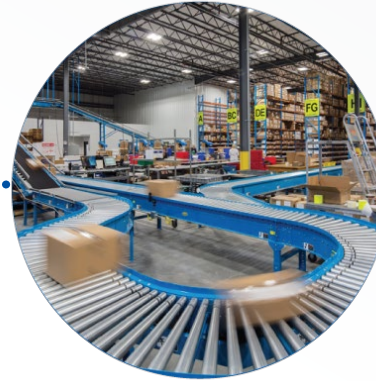
Warehouse Kitting & Assemblage