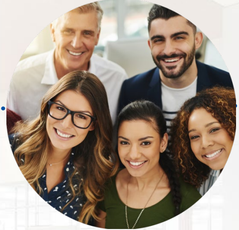
Reward, Recognition & Incentive Solutions