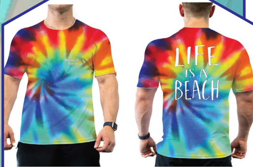
MODEL IS WEARING A LARGE