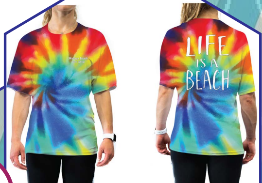
MODEL IS WEARING A SMALL

Starting point of the T-shirt is white and we are dye subbing all over (front and back). Super soft and the most comfortable fabric. 4way stretch to fit all body shapes and sizes. Seamless around shoulders and armpits to avoid chafing and to produce perfect prints. 95% Polyester / 5% Spandex, moisture wicking fabric. 1" bottom hem.