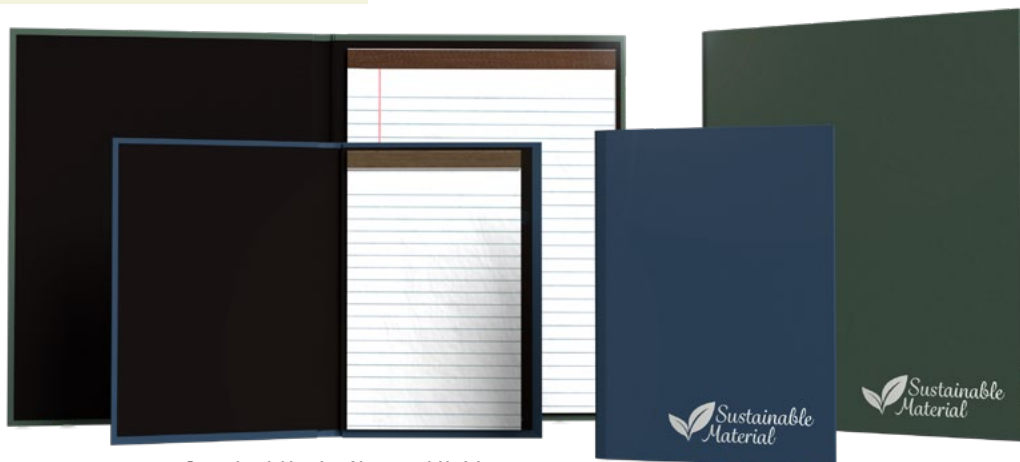
Standard/Junior Notepad Holder

We are committed to providing sustainable products to help create a more environmentally friendly planet. These materials for covers, liners, chipboard and paper notepads have been vetted for attaining this goal.