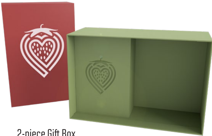
2-piece Gift Box