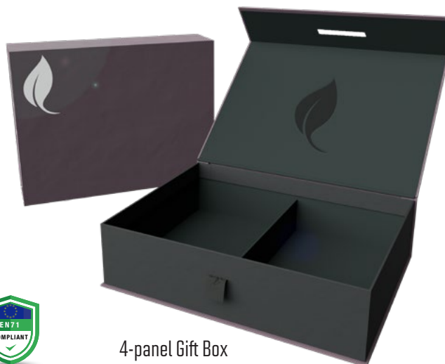
4-panel Gift Box