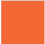
Orange PMS 172C