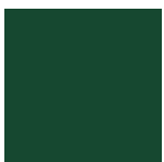
Hunter Green PMS 7736C