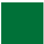
Kelly Green PMS 7733C

Accessories made of Flock Fabric made in U.S.A. Available colors and quantities unlimited depending on order quantity.