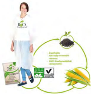
BIODEGRADABLE GMO-FREE CORNSTARCH RAIN PONCHO