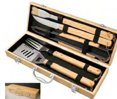
BAMBOO BBQ SET