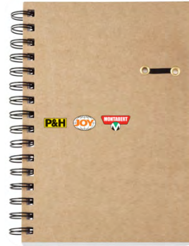
ECO COMBO NOTEBOOK AND PEN