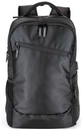
Basecamp Tech Backpack