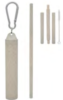
REUSABLE STRAW MADE FROM WHEAT