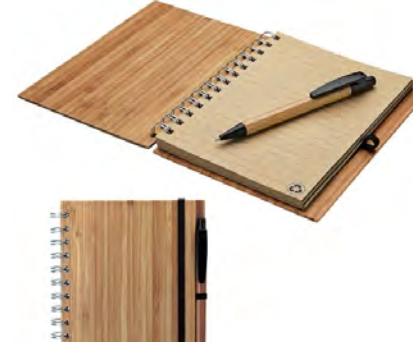
BAMBOO JOURNAL & BAMBOO PEN