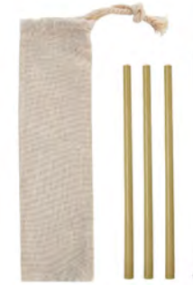
BAMBOO STRAW SET WITH CLEANER