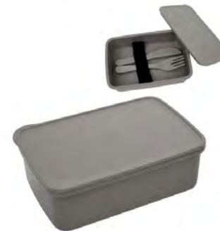
WHEAT LUNCH SET