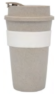
WHEAT COFFEE TUMBLER