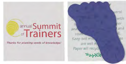
SEED PAPER PACK