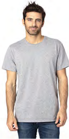
THREADFAST ULTIMATE T-SHIRT Made with 40% Reprieve Recycled Polyester.