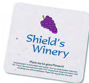
SEED PAPER COASTER