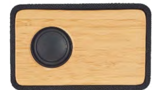
NATURAL BAMBOO BLUETOOTH SPEAKER