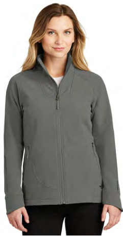
THE NORTH FACE TECH SOFT SHELL JACKET Constructed with 50% recycled polyester. WindWall technology fabric.