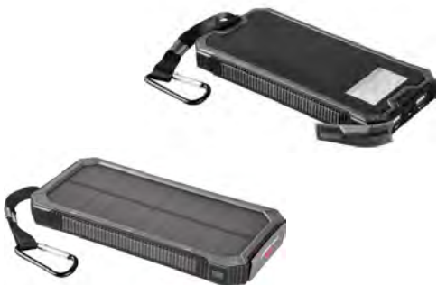
HIGH SIERRA 10,000 MAH SOLAR POWERED, POWER BANK