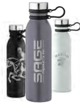
Basecamp 24 oz Stainless Steel Vacuum Insulated Bottle

Your purchase makes a difference! A portion of the proceeds of this sale will be donated to fund the Warrior spirit retreat, a place where warriors learn to heal. To contribute to the warrior spirit retreat fund or to learn more, please visit www.Warriorspiritretreat.Org