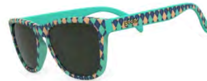
THE OGS SWEATER VEST FOR YOUR FACE

While there is not a giveback or sustainable story with this brand, it's a fun and unique approach to performance sunglasses. Fits the outdoor lifestyle aspect of the Subaru brand.