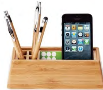
BAMBOO DESKTOP ORGANIZER