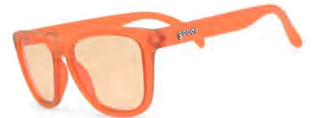
THE OGS ORANGE YOU GLAD WE DIDN'T SAY BANANA?

NO SLIP. NO BOUNCE. ALL POLARIZED. ALL FUN.