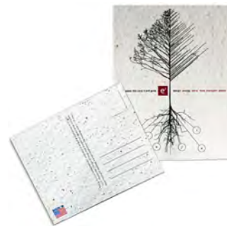
SEED PAPER POSTCARD