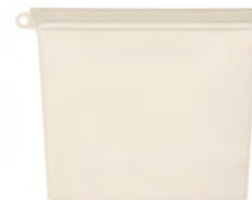
REUSABLE SILICONE FOOD BAG