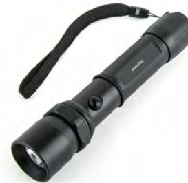
Basecamp 2200 mAh Powerbank Flashlight