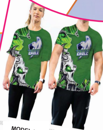
MODEL IS WEARING A LARGE