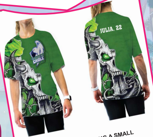
MODEL IS WEARING A SMALL

Starting point of the T-shirt is white and we are dye subbing all over (front and back). Super soft and the most comfortable fabric. 4way stretch to fit all body shapes and sizes. Seamless around shoulders and armpits to avoid chafing and to produce perfect prints. 95% Polyester / 5% Spandex, moisture wicking fabric. 1" bottom hem.