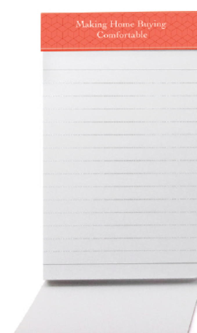
Ruled Paper Standard pad option