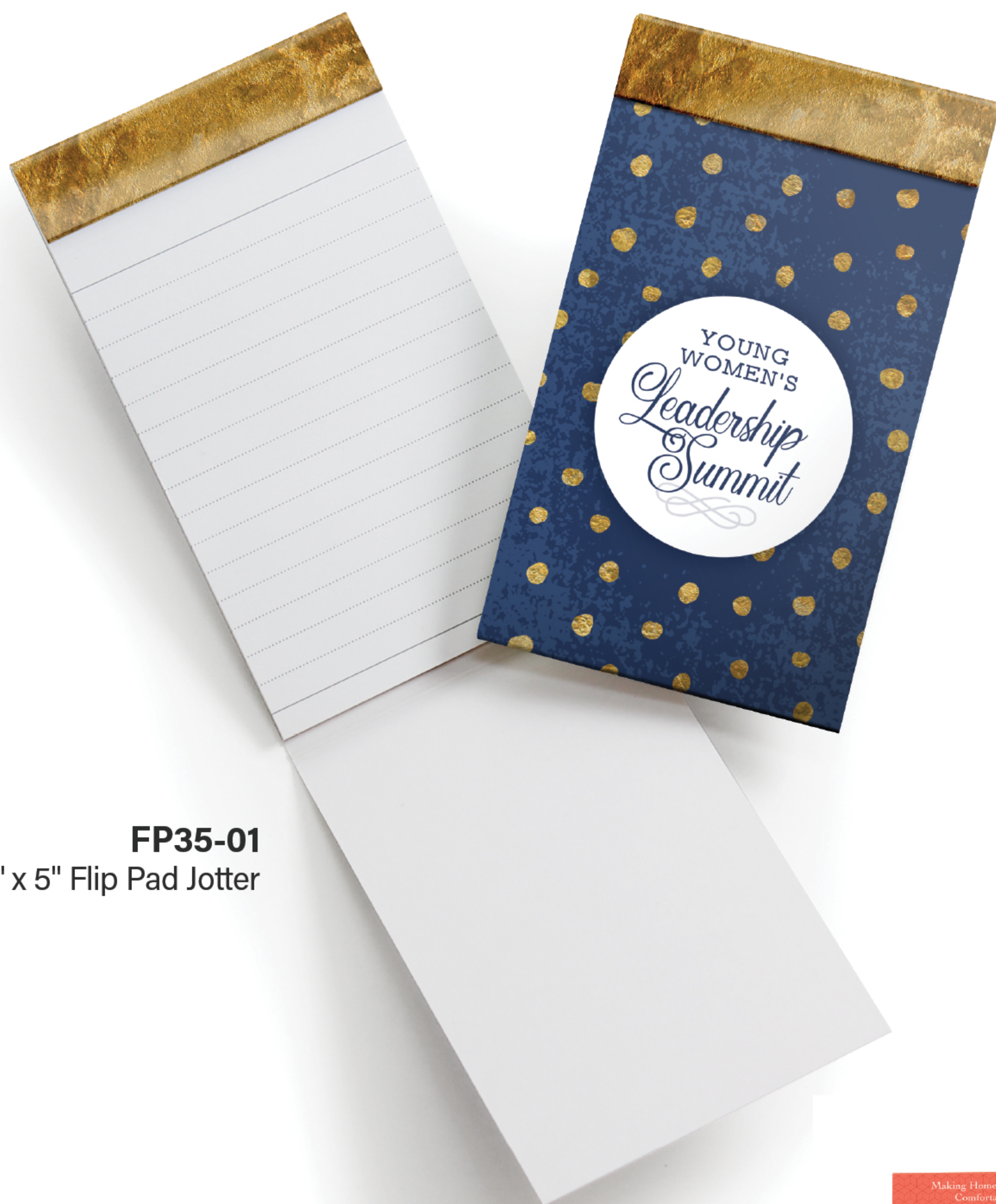
FP35-01 3" x 5" Flip Pad Jotter