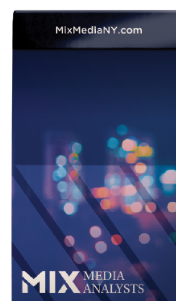
FP35-01 | 3" x 5" Fits in pockets and purses

Jotting down contact info Shopping and to-do lists On-the-go brainstorming