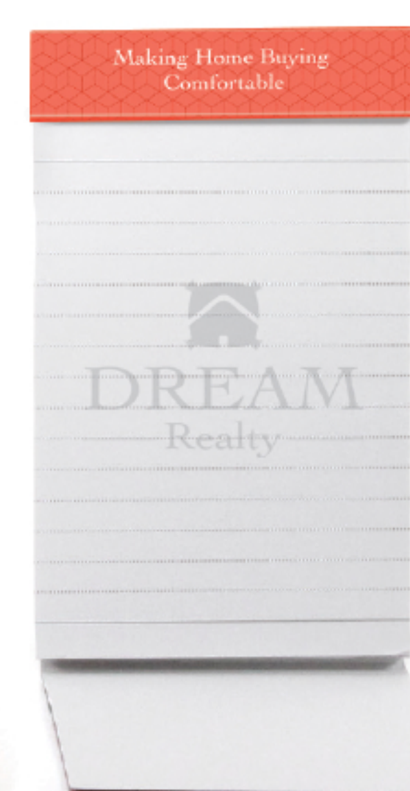
Watermark Logo Ruled or plain paper