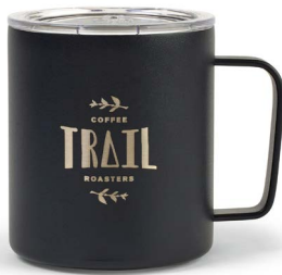
MiiR® Vacuum Insulated Camp Cup - 12 Oz.

3.5L 4H 3.5W; 18/8 Stainless Steel 100273-009 Black Powder • 100273-104 White Powder