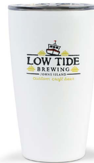
MiiR® Vacuum Insulated Tumbler - 12 Oz.

3.25L 5.75H 3.25W; 18/8 Stainless Steel 100274-009 Black Powder • 100274-104 White Powder