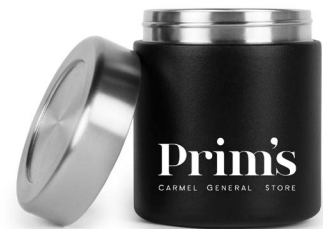
MiiR® Vacuum Insulated Food Canister - 16 Oz.

4.25L 5H 4.25W; 18/8 Stainless Steel 100277-009 Black Powder 100277-104 White Powder