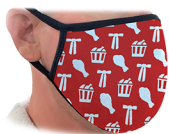
BLACK OR WHITE TRIM OPTIONS