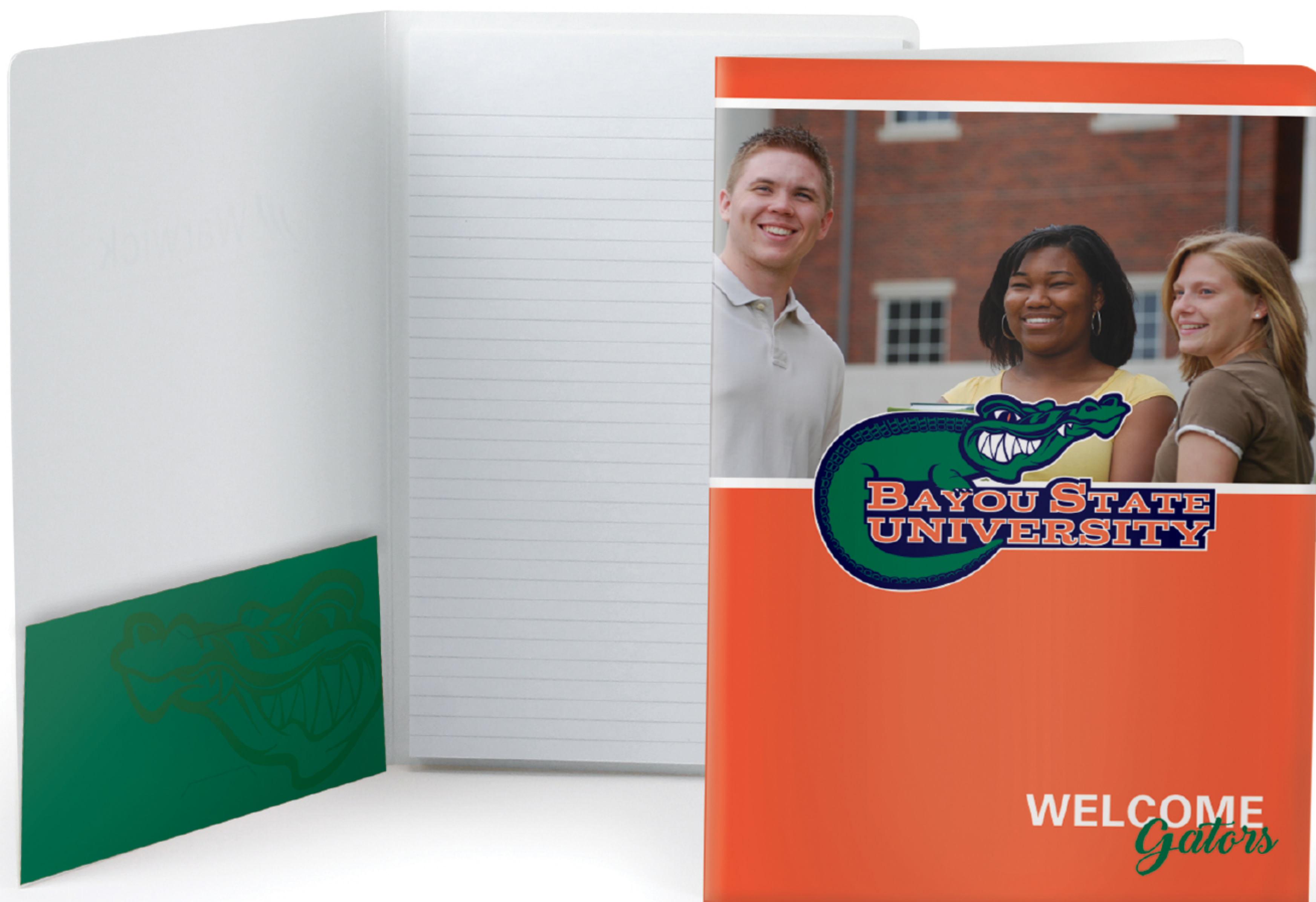
938 Digital Print Mini Padfolio

Printed in full color for vibrant branding