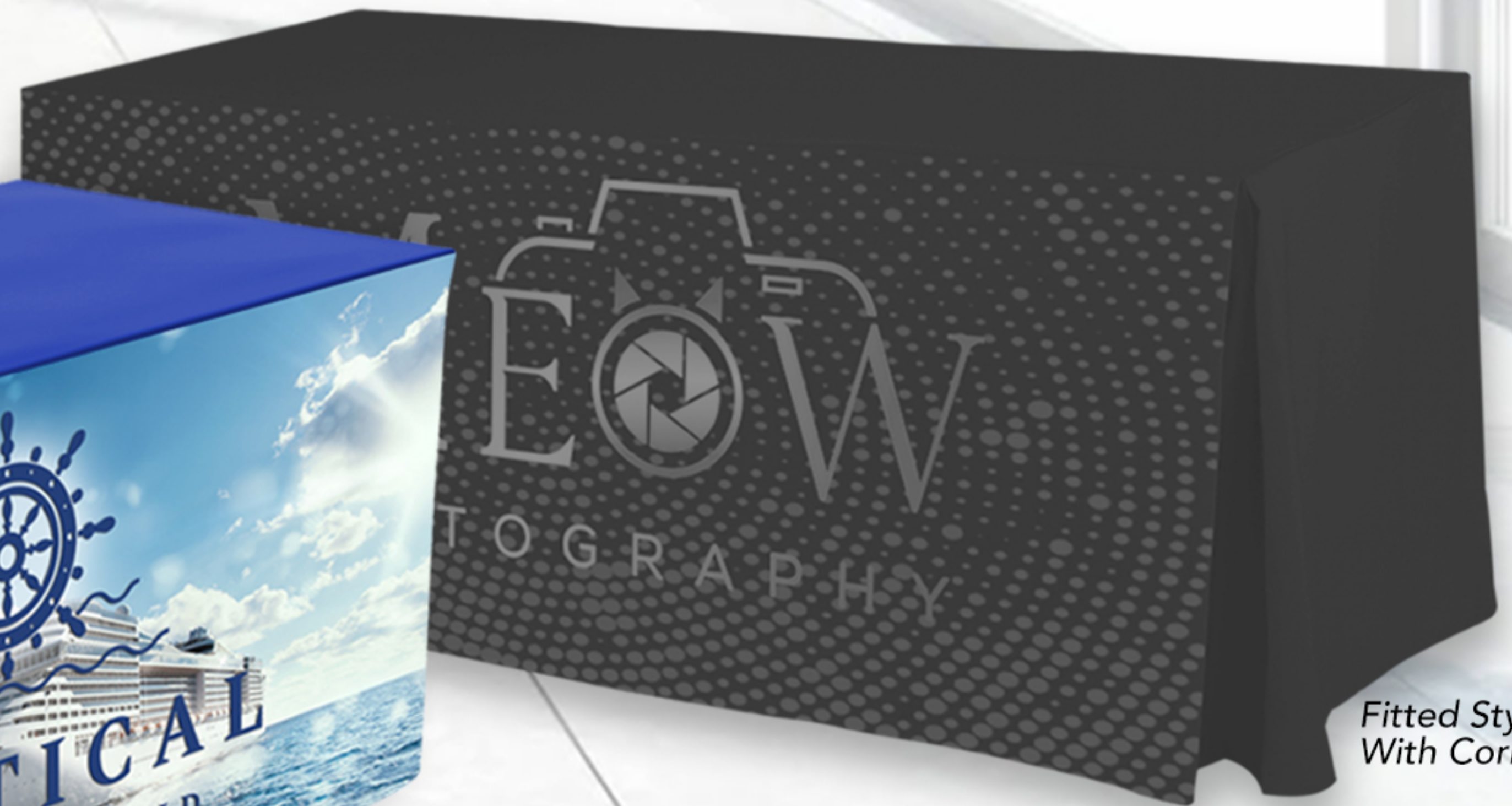
Fitted Style With Corner Pleats