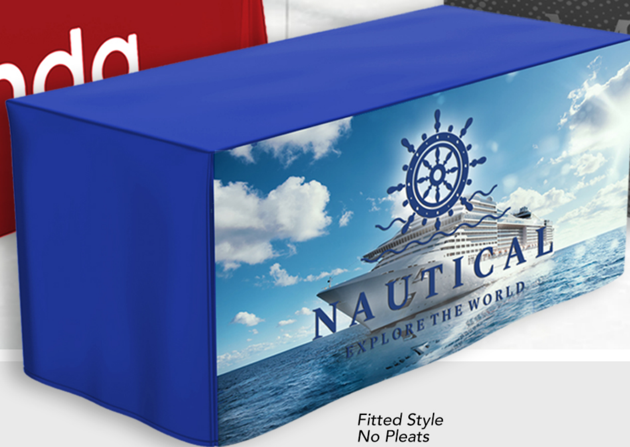
Fitted Style No Pleats